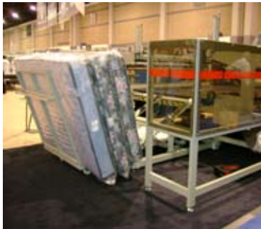
Optional cart stacker accepts finished wrapped beds and self-loads onto cart.