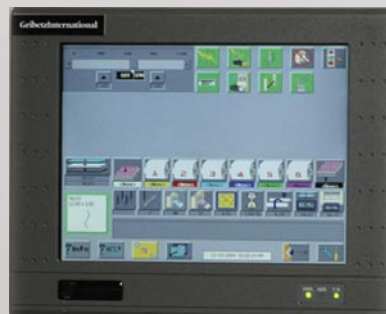
Windows® CE icon-based touch screen